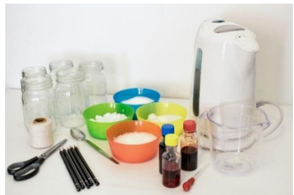
Example of materials for your experiment