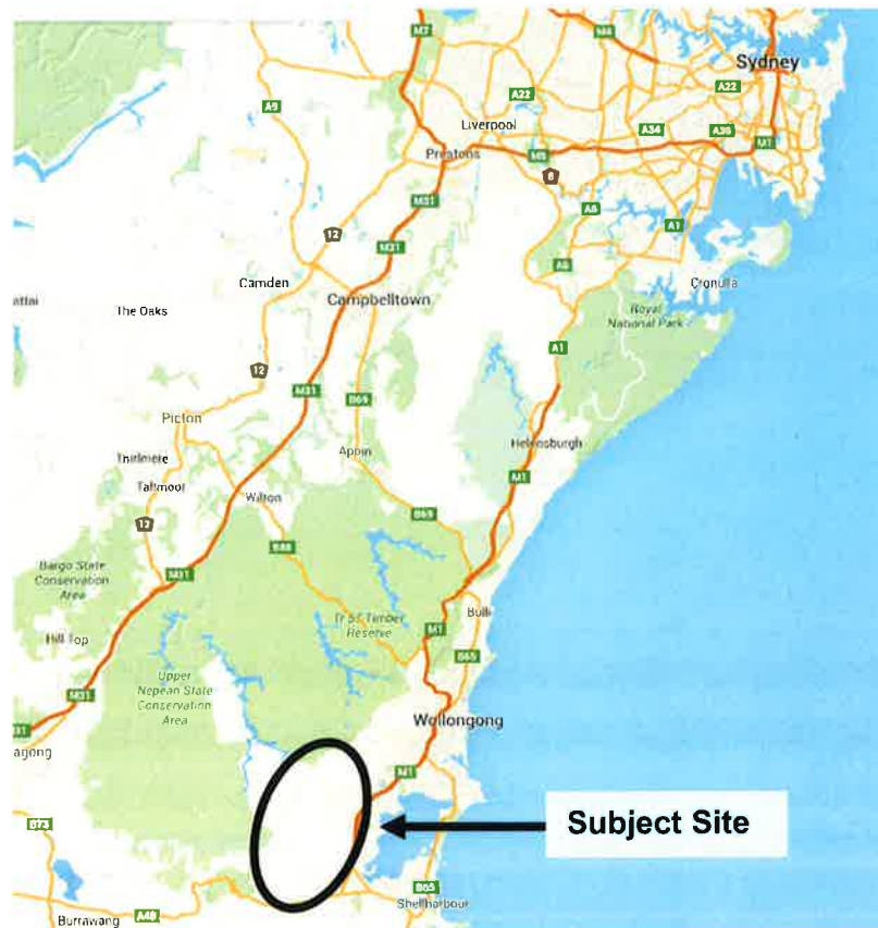
Figure 1 – Location of site in context with Sydney CDB

The site includes watercourses within the Lake Illawarra Catchment including Dapto Creek, Mullet Creek, Reed Creek, Robins Creek and Macquarie Rivulet.