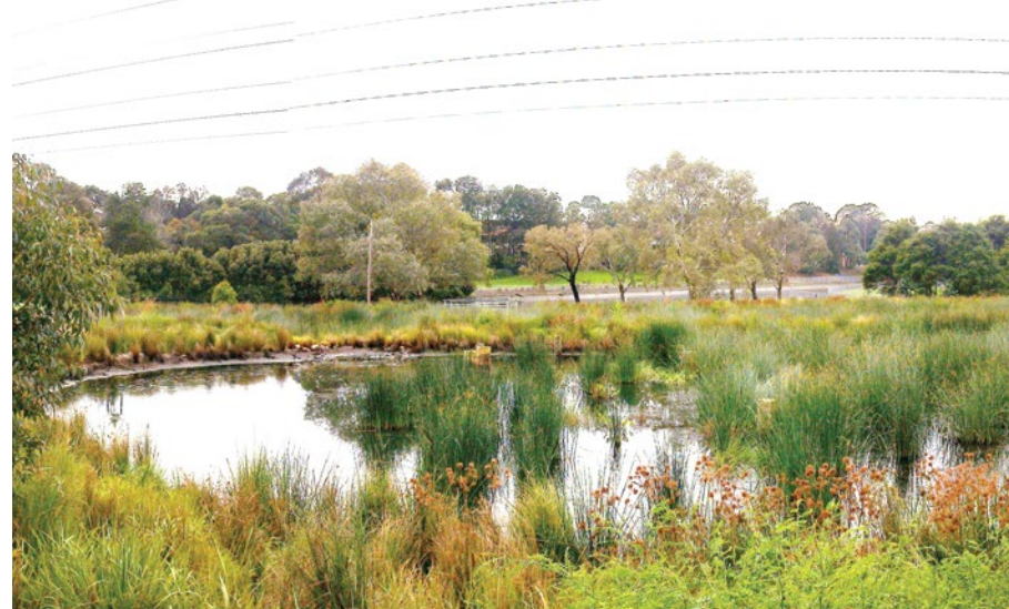
Proposed Wetland To Improve Water Quality, Provide Habitat and create a Unique Community Space (Cup and Saucer Wetland)