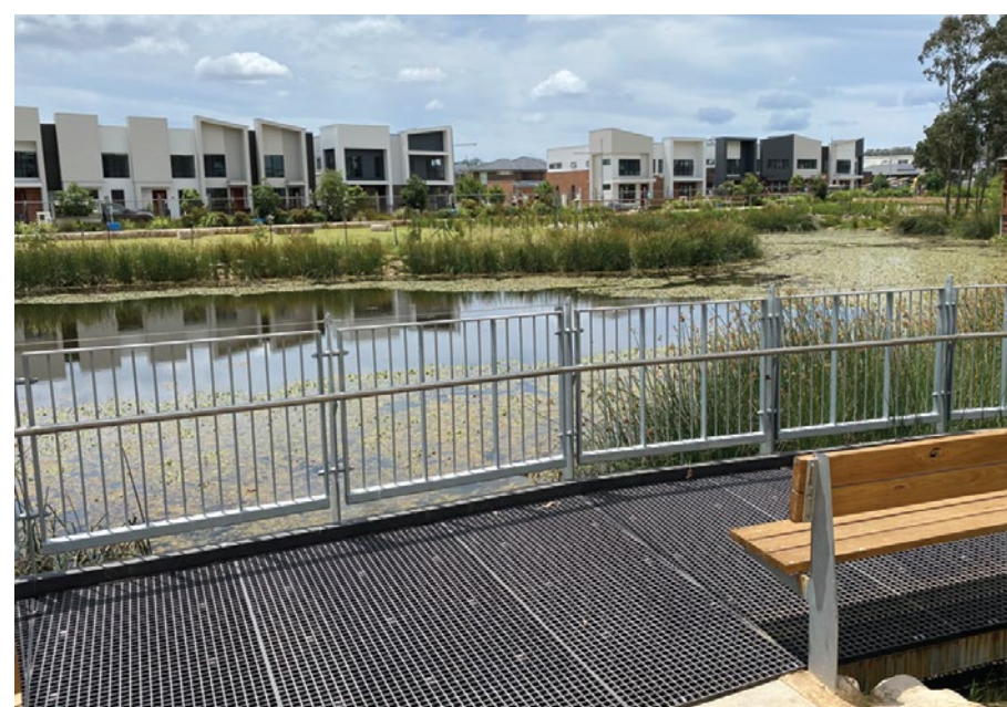
Proposed Wetland Viewing Deck (TBLD Willowdale Riparian Corridor)