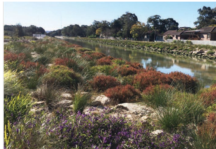
Proposed Naturalised Banks will replace existing concrete/brick channel (Powells Creek)