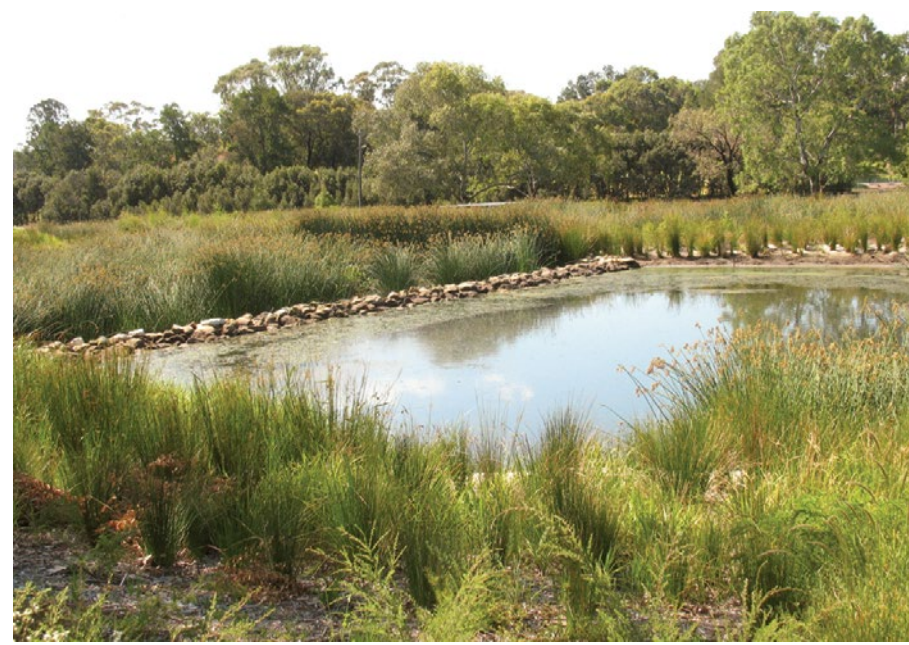
Proposed wetland (Cup and Saucer Wetland)