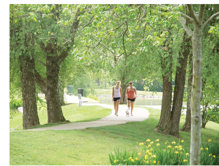
New concrete connection path for recreation and movement