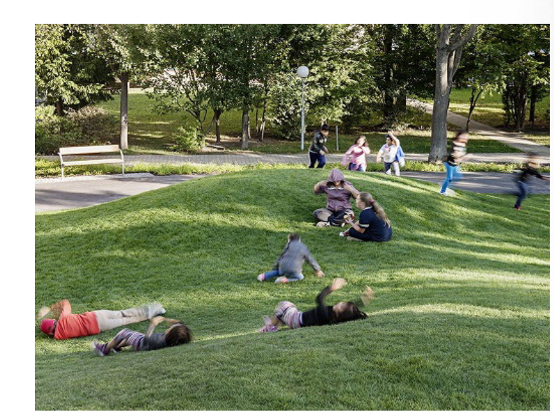
Proposed 1-1.5m high turf and planted mound