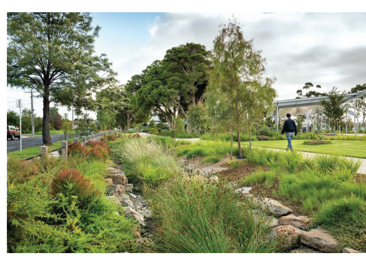
Water Sensitive Urban Design swales