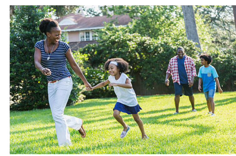
Passive and active recreation open