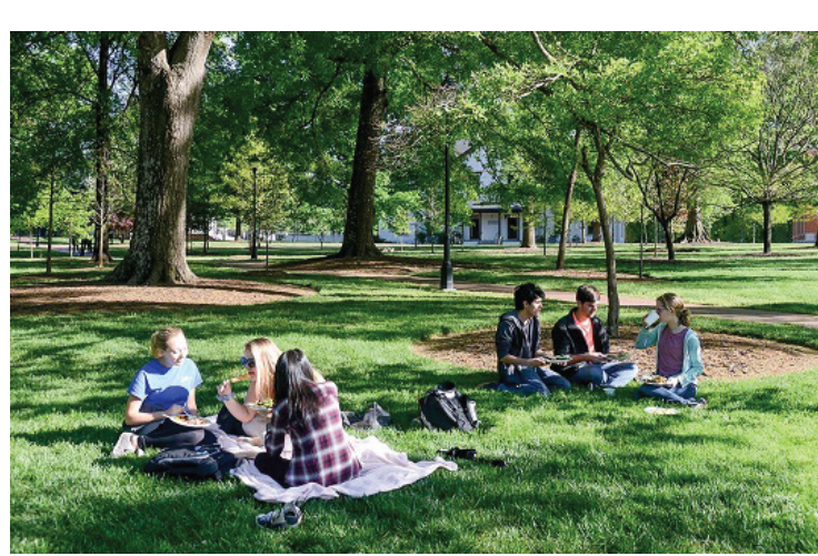
Shaded areas for recreation