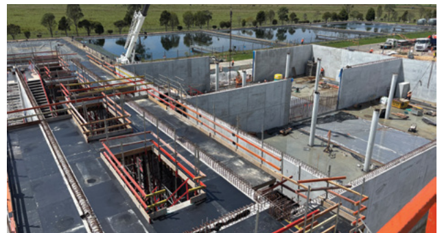
Construction of the tertiary filter is progressing well inside the Richmond WRRF

The temporary laydown area to store materials and equipment in Inalls Lane is now ready for use, and we have completed investigation work along the pipeline alignment on Francis and Pitt streets.