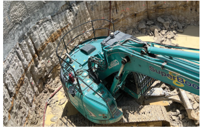
The team is currently excavating through rock up to 19 metres deep for the new pump station

At Redbank Creek, underground drilling has been completed and the new pipeline has been installed. The construction of the pipeline will now continue from Redbank Creek, through North Richmond heading towards Richmond crossing the Hawkesbury River. The pipeline will transfer the wastewater flows from North Richmond to Richmond for treatment.