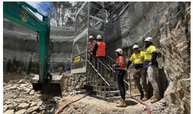
The project team conducts regular safety audits to protect our team during the pump station excavation