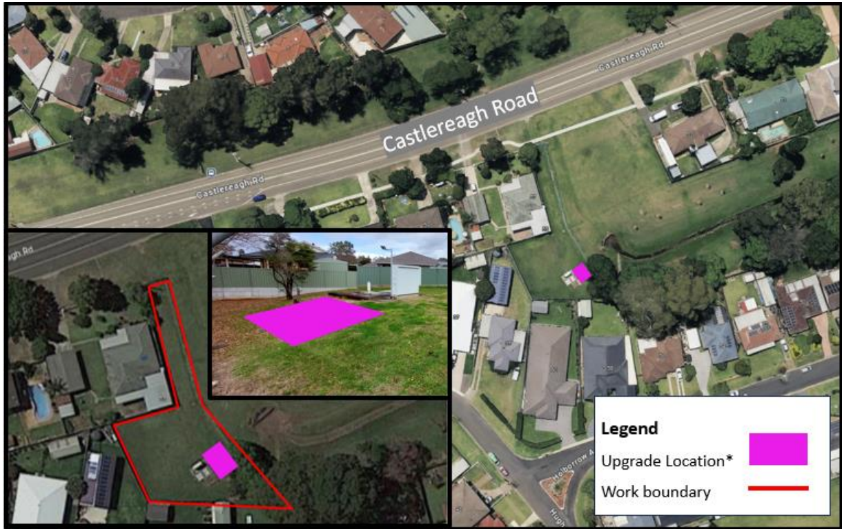
The new kiosk footprint overlaps the existing kiosk location.