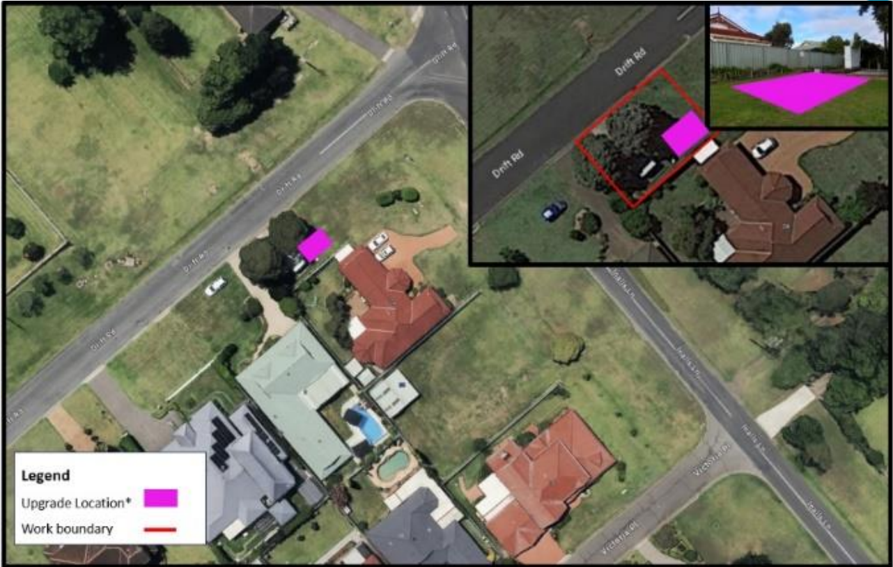
The new kiosk footprint overlaps the existing kiosk location.