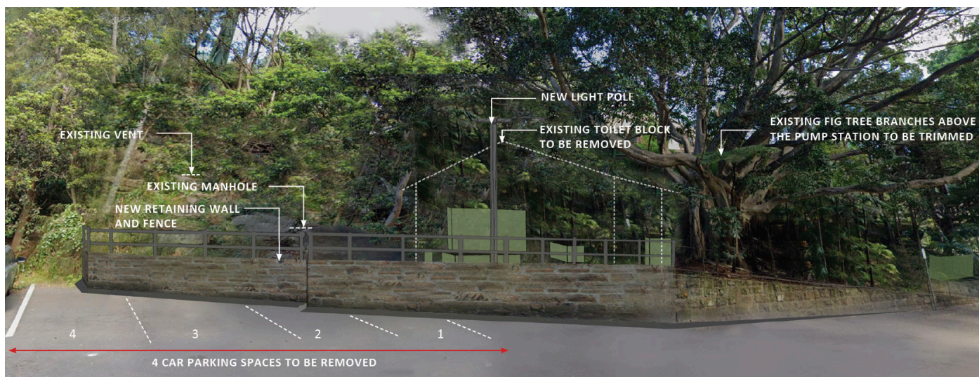
Image: Parsley Bay - pump station

The other project site in Parsley Bay is the new amenities facility on the ground floor of the existing Caretaker's Cottage. The facility will improve services for visitors to the Reserve with new female and male bathrooms, showers and a ramp for better access.