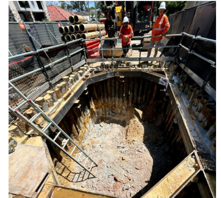
Maintenance hole at Carlisle Street.

Following this stage, the Parsley Road and Hopetoun Avenue access points to Parsley Bay Reserve will be temporarily closed to allow for excavation work within the reserve. Pedestrian access will be maintained via Horler Avenue, Fitzwilliam Road, and The Crescent.