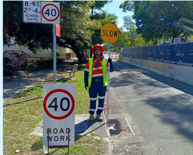
Reducing the speed limit around construction zones improves safety for everyone.

During construction work on Carlisle Street in Rose Bay, it is important to follow the direction of traffic controllers and speed limits in the area. For the safety of pedestrians, motorists, the community, and our workers, a 40km per hour speed limit is in place. This reduction in the speed limit improves driver awareness of changed traffic conditions.