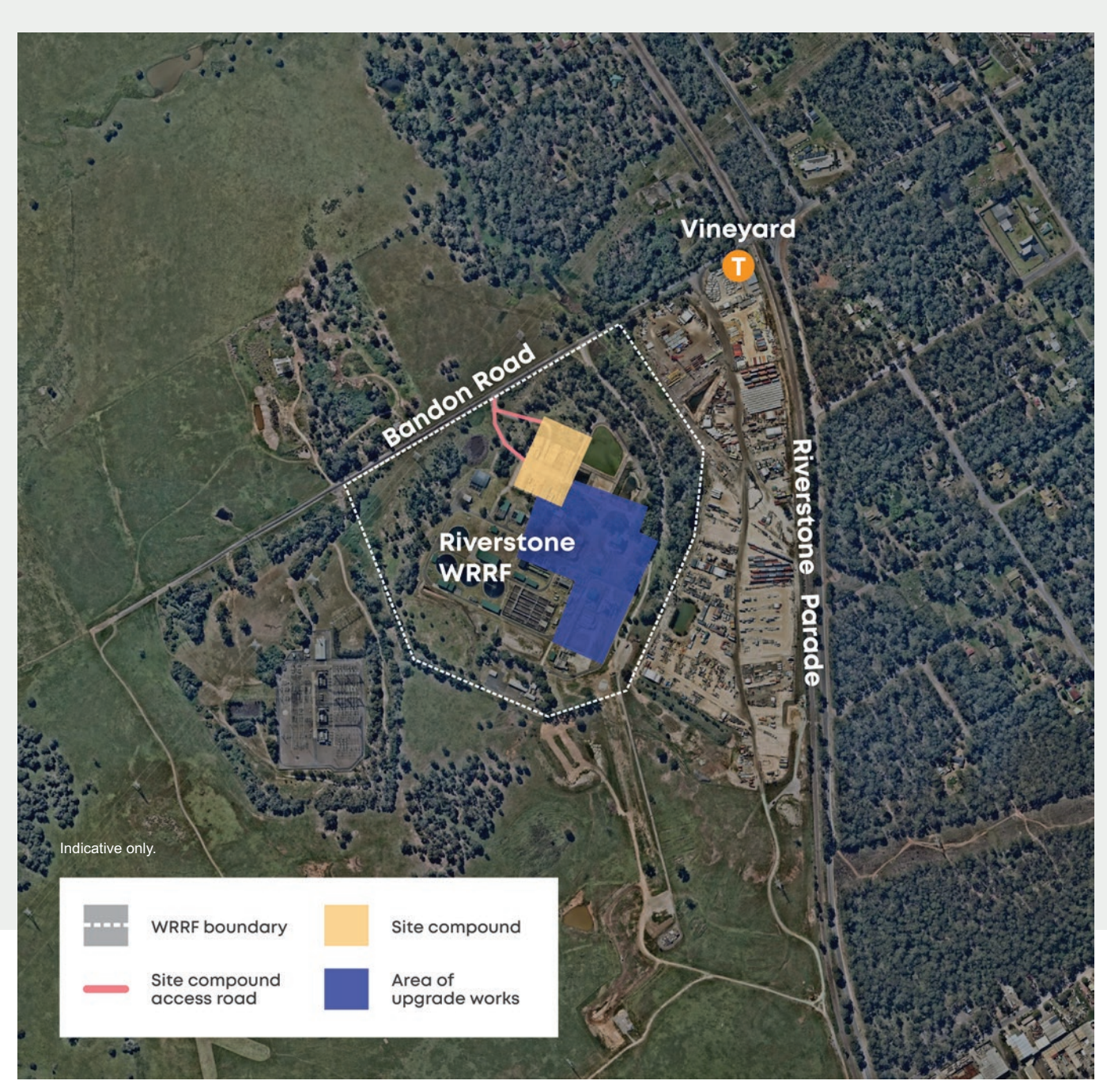
Riverstone Water Resource Recovery Facility

As part of the project we will need to upgrade the electricity network along Bandon Road and Riverstone Parade. The work will not start until 2025 and we will keep the community updated as our plans progress.