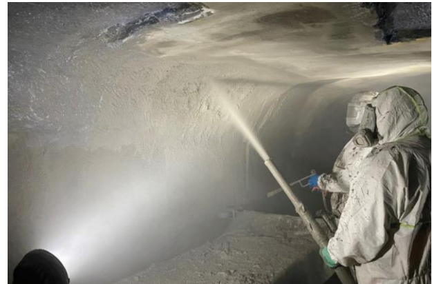
Our work crew rehabilitating the NSOOS tunnel below ground.

This important work will help to pave the way for future sections of the NSOOS to be rehabilitated and once completed, will increase capacity, assist in preventing overflows and extend its lifespan.