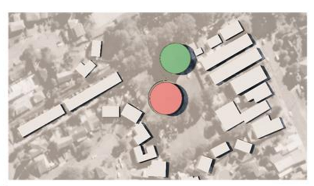
Summer afternoon (3 pm)