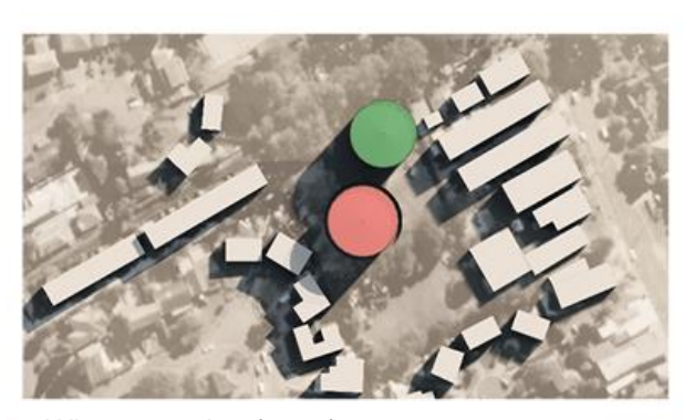
Winter morning (9 am)