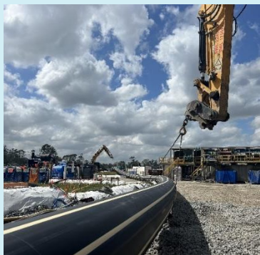
Photo: HDD Installation Gurner Ave, Austral

Sydney Water is delivering a transformative investment in our city to ensure our water, wastewater and stormwater systems meet the needs of our customers now and in the future.