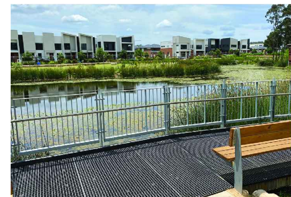
Proposed Wetland Viewing Deck (TBLD Willowdale Riparian Corridor)