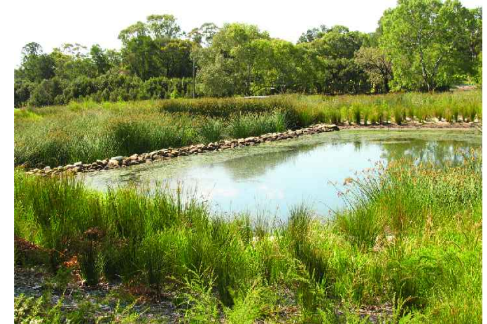
Proposed Wetland (Cup and Saucer Wetland)