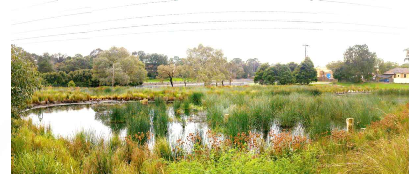
Proposed Wetland To Improve Water Quality, Provide Habitat and Create a Unique Community Space (Cup and Saucer Wetland)