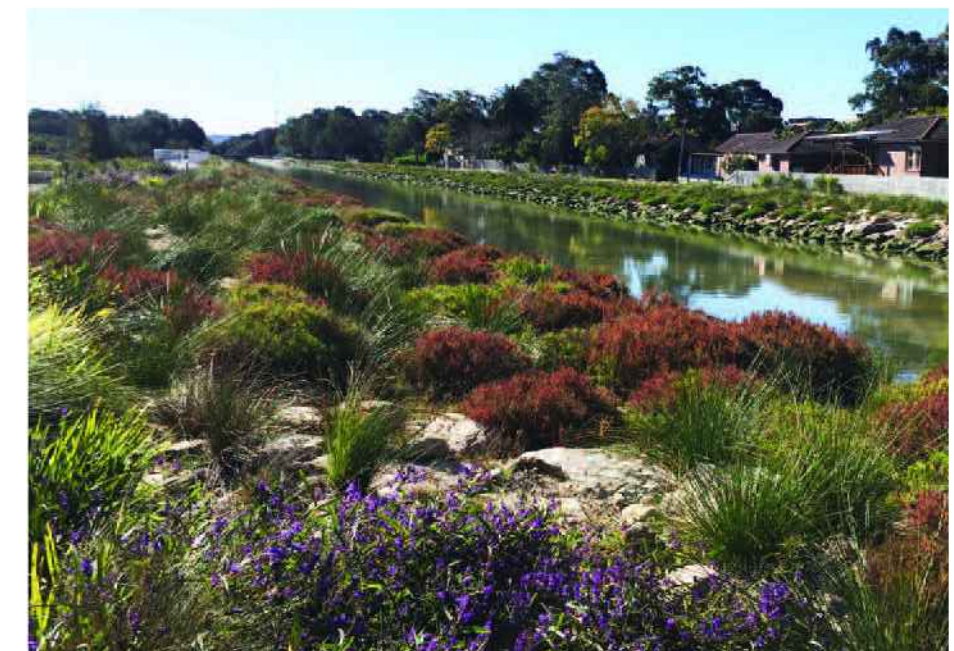
Proposed Naturalised Banks will replace existing concrete/brick channel (Powells Creek)