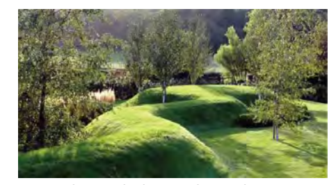
Proposed 1-1.5m high grassed mounds