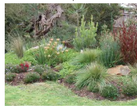
Proposed 2-3m wide native shrubs and grasses