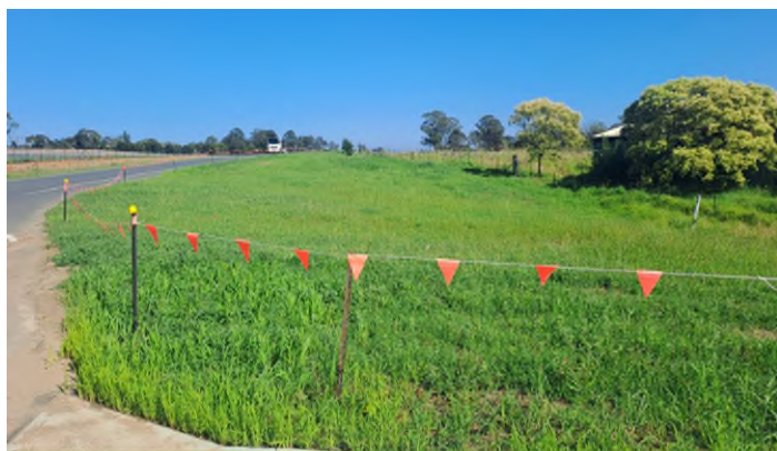
Restored M12 corridor following our construction activity

All construction activities along the M12 Corridor are now complete. We'd like to thank the nearby residents for their understanding and patience while the pipelines were installed. Below is an image of the restored corridor which we have planted out with local native grass mix. The great weather we have had recently has helped it establish and grow, ready for its first mow.