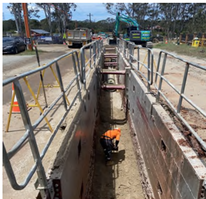
Trenching work along Cross Street

Trenching activities along Cross Street will continue until March 2025, weather permitting.