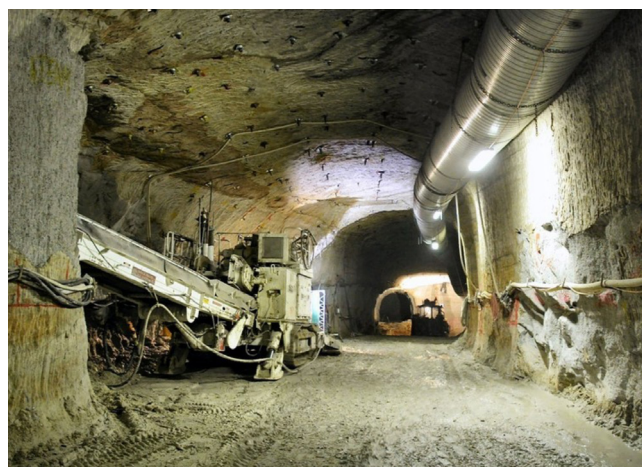
One of many underground caverns housing underground assets.

This project will have minimal impact on the community, however, there will be times where we may have some staff and machinery on site at the Bondi Golf course for various Geotech testing.