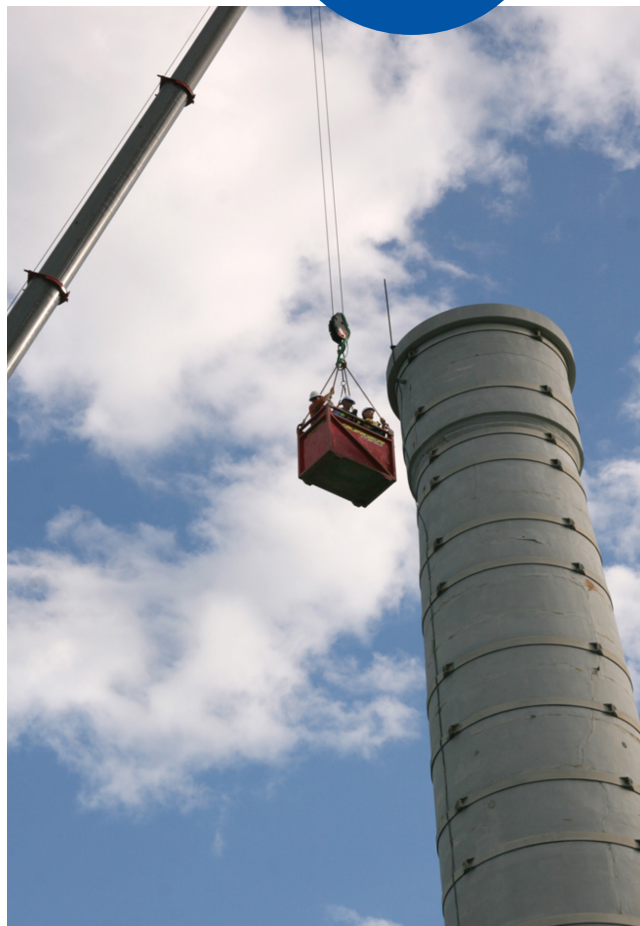
Our crews doing an external condition assessment of the Ben Buckler Shaft.

Short term repairs are expected to begin early in 2023 and long term plans will be determined after the condition assessment has been completed. Our aim is to ensure that we preserve the Ben Buckler shaft so that it continues to work for another 100 years, as well as protect its important heritage value.