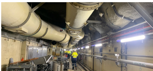
An underground view of the ventilation systems at the Bondi WRRF.

What's Next – Further ventilation systems upgrades are planned in 2023. This work is scheduled to be done during winter, when we have less odour impact due to cooler temperatures.