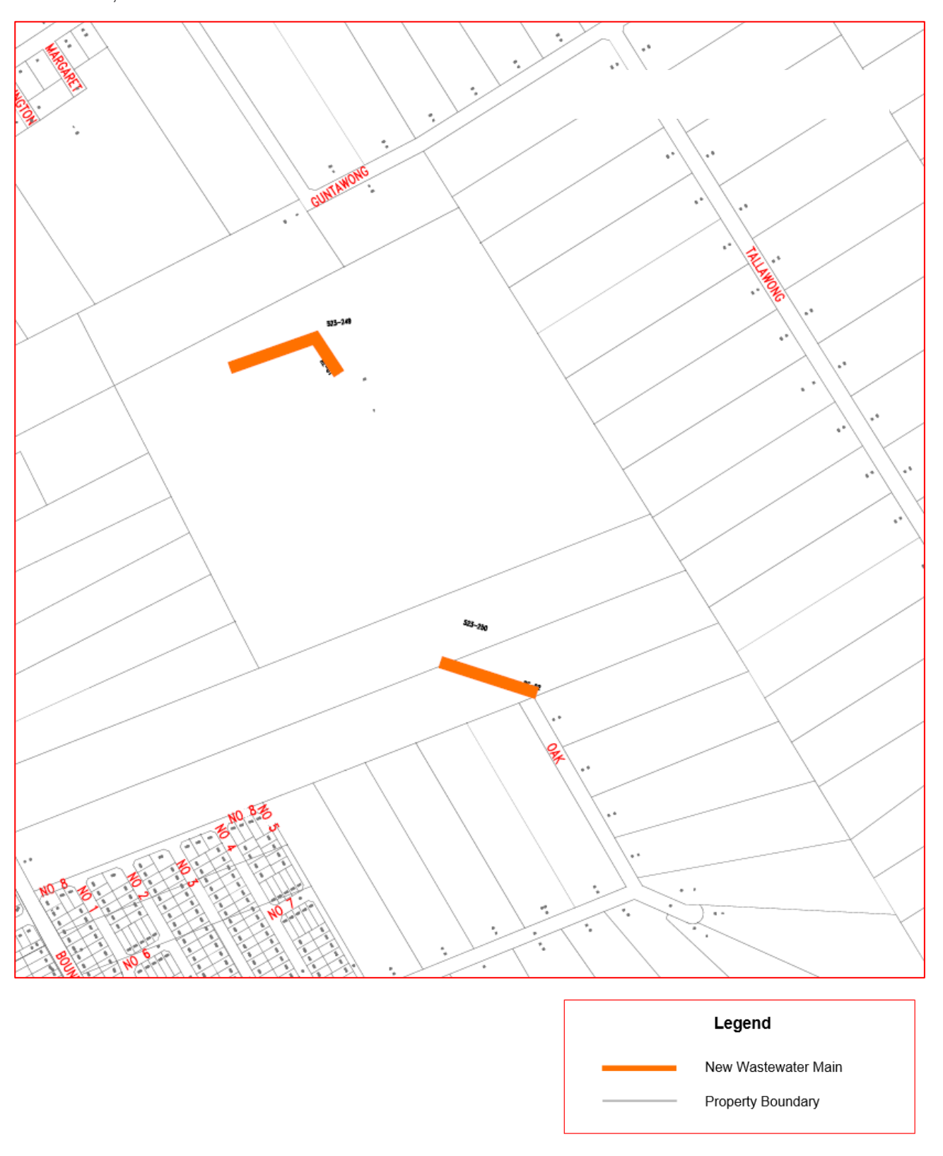
Figure 2 – Approximate location of new wastewater mains near Guntawong Road, Riverstone and Oak Street, Schofields