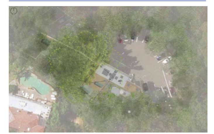
A wastewater pump station will be built in the footprint of the current amenities block.