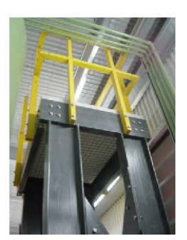
FIGURE 13 - SUPPORTS