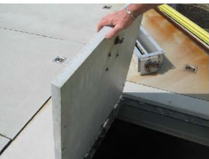
FIGURE 6 - INLET WORKS COVERS FIGURE 7 - INLET COVER PANEL