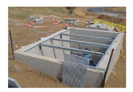
FIGURE 12 - VC COVER and SUPPORTS

The picture below shows a Sydney Water valve chamber using FRP grating and support members, installed in 2002. The other picture shows FRP being used as supporting members. <u>See Figures 12 and 13</u>