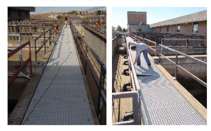
FIGURE 14 - CHANNEL GRATING FIGURE 15 - CHANNEL GRATING

FRP grating has been installed over open sewage channels in the Treatment Plant. It has been in place for at least 6 years. Supporting members for the grating are stainless steel. Bathurst Regional Council staff are very satisfied with the installation. <u>See Figures 14 and 15</u>