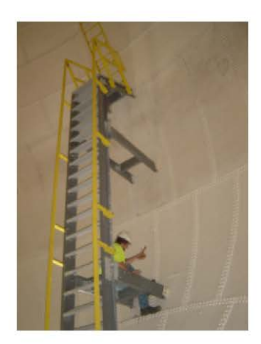
FIGURE 11 - LADDERS