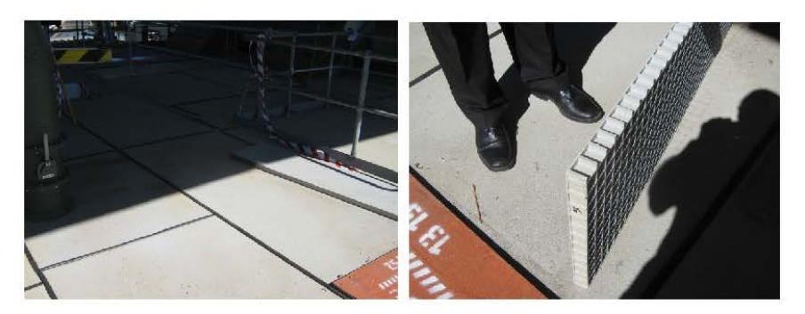
FIGURE 4 - INLET WORKS COVERS FIGURE 5 - INLET COVER PANEL

The inlet works was covered with steel grating until recently. It was decided to replace all the grating due to heavy corrosion. The grating was replaced in 2012 with FRP grating (composite with top plates to eliminate odours). See Figures 4 and 5