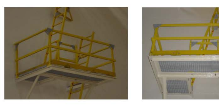
FIGURE 8 - LADDERS

The reservoir internal staircase and platform (including supports), normally fabricated from steel, was fully fabricated using FRP & installed around 2007. <u>See Figures 8 and 9</u>