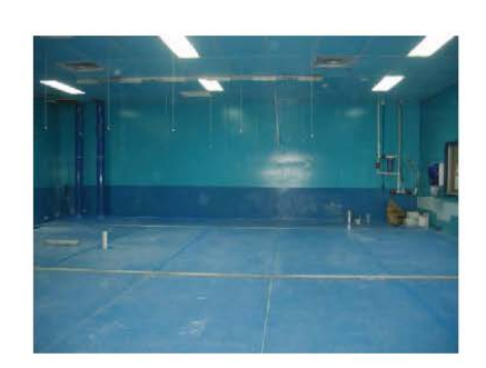
FIGURE 17 - SOLID TOP FLOOR