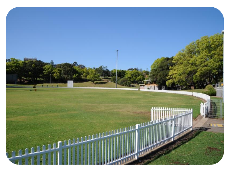
Recycled water from sewer mining can be used to irrigate sports fields