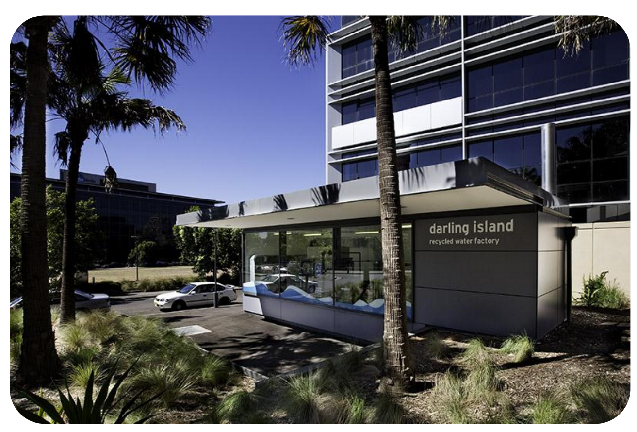
The on-site sewer mining facility at Workplace 6 produces over 10 million litres of recycled water each year