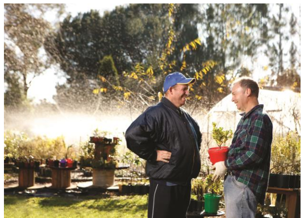
Ask other gardeners or nursery in your local area for advice on what to plant.

You can also use our plant selector tool to help choose plants suited to your local soil and weather conditions. Find it at sydneywater.com.au under Your home / Saving water at home / Garden & pool / Choose the right plants.