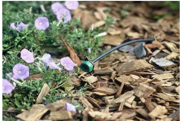
Using a thick layer of mulch helps to protect the soil.

www.environment.nsw.gov.au under Environmental issues / Soil degradation / Salinity.