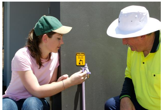
Ensure the recycled water handle is removed when the tap is not in use.