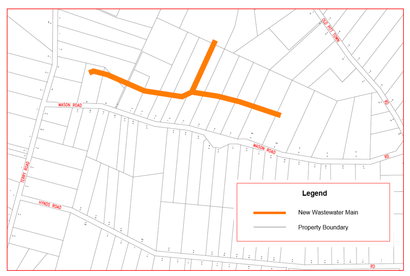
Figure 2 – Approximate location of new wastewater mains near Mason Road and Terry Road, Box Hill