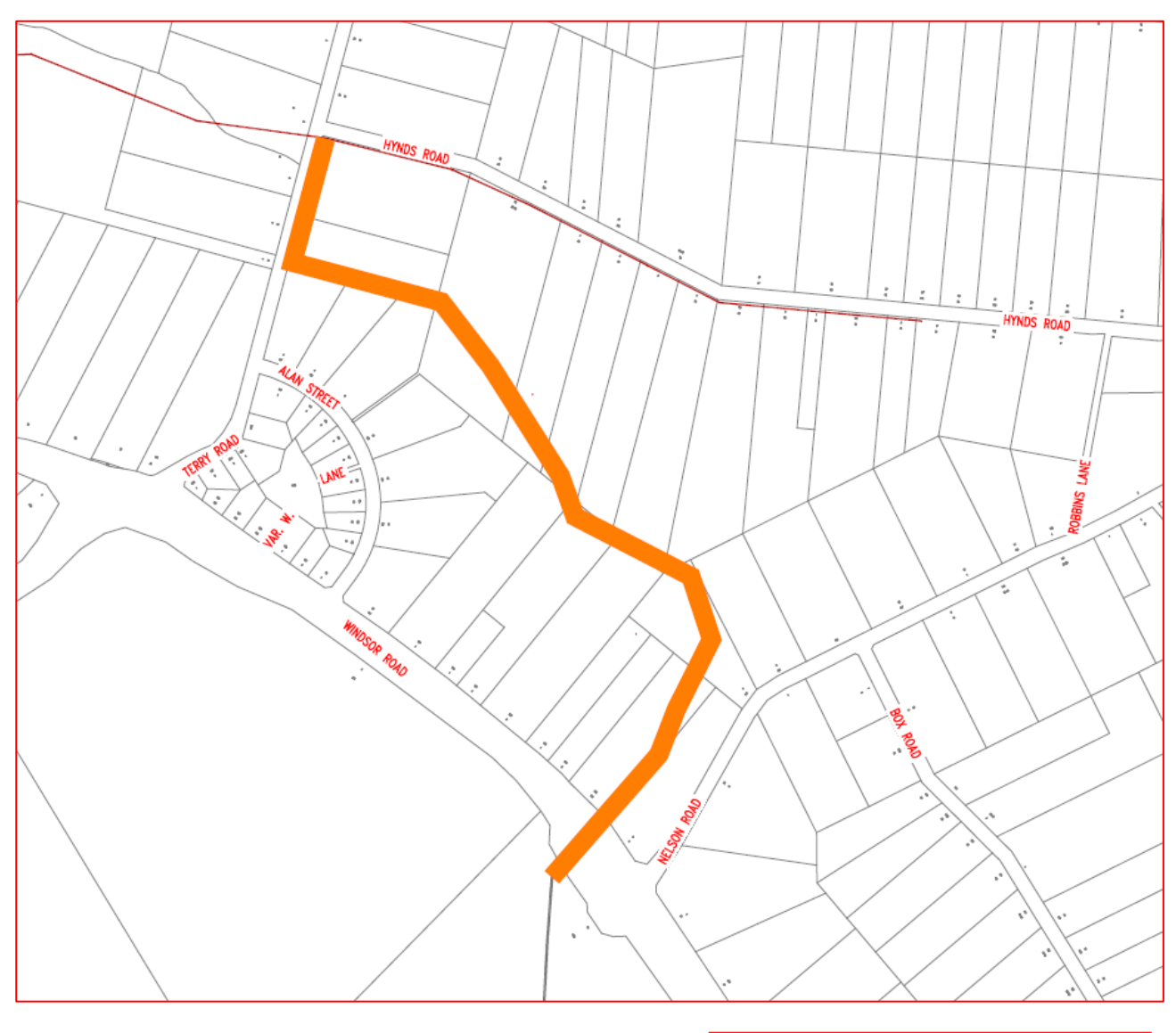
Figure 4 – Approximate location of new wastewater mains near Hynds Road, Terry Road, Alan Street, Nelson Road and Windsor Road, Box Hill