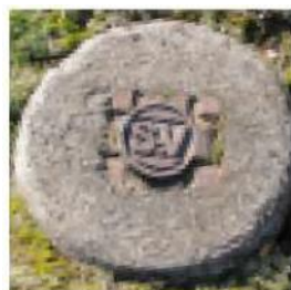
Water Stop Valve