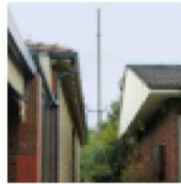
Sewer Vent Shaft