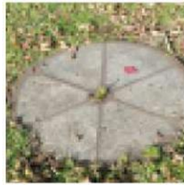
Sewer Maintenance Hole