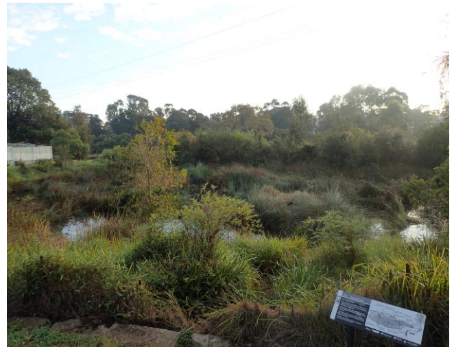
Cup and Saucer Creek constructed wetland in Canterbury treats stormwater runoff from local streets before it enters the Cooks River and has become a thriving wild life habitat area.