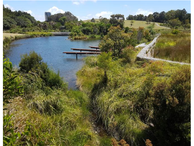
Constructed wetlands in Sydney Park provide stormwater treatment, improve views and create habitat for wildlife