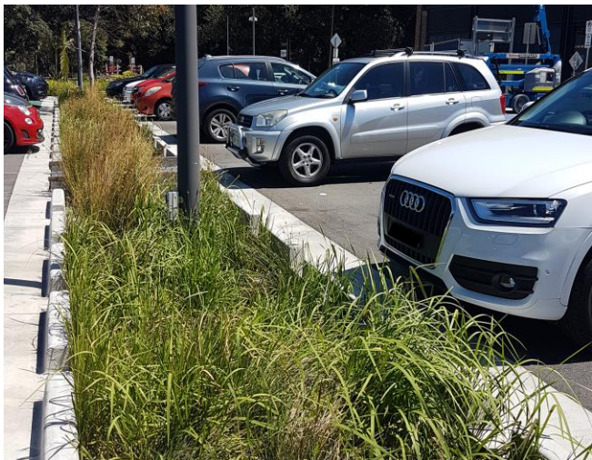
Swales in carparks or near other large areas of pavement collect stormwater runoff and remove pollutants