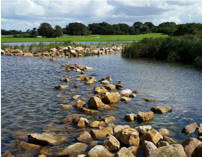
The wetlands at Astrolabe Park act as a natural filter for the stormwater outlet

WSUD comes in many forms and can be seen in many places. Some examples include rainwater tanks, raingardens, bio-retention, constructed wetlands and swales. WSUD works best when stormwater is treated close to its source. For example, a raingarden or wetland in a park collecting and treating stormwater from local streets before that water enters a creek or river.