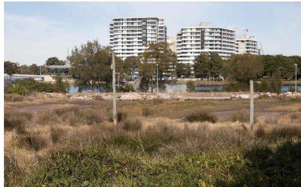
This image is from point C marked on the image on page 1

All of them are looking over the water. Why?