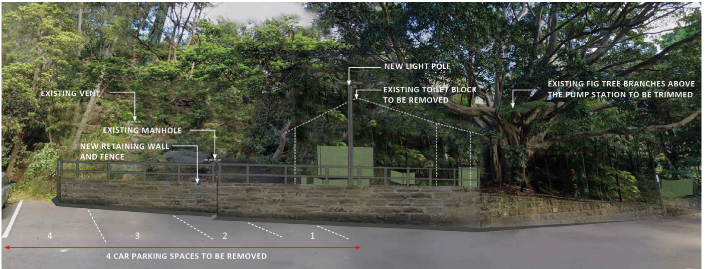
Image: Parsley Bay - pump station

The other project site in Parsley Bay is the new amenities facility on the ground floor of the existing Caretaker's Cottage. The facility will improve services for visitors to the Reserve with new female and male bathrooms, showers and a ramp for better access.