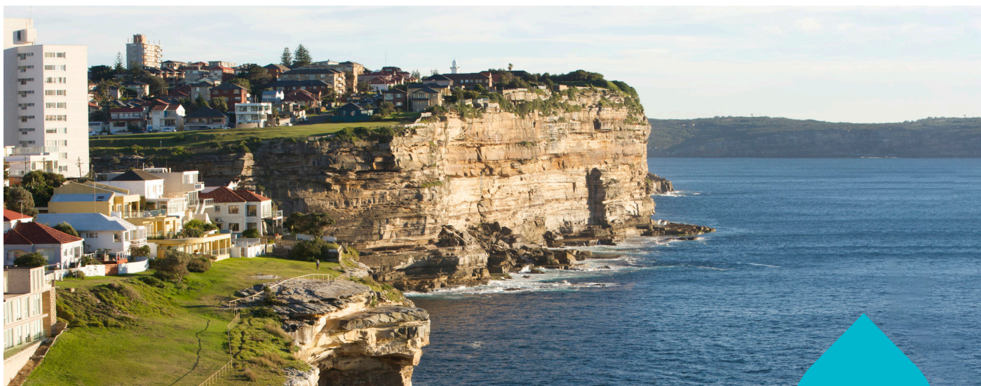
Image: Diamond Bay

We will do everything we can to minimise construction impacts, such as using noise blankets to minimise noise, measures to minimise dust, sediment controls, and switching off machinery when it isn't being used. We will erect fencing to keep everyone safe during our work and will write to nearby homes to explain how we will manage construction before work begins.