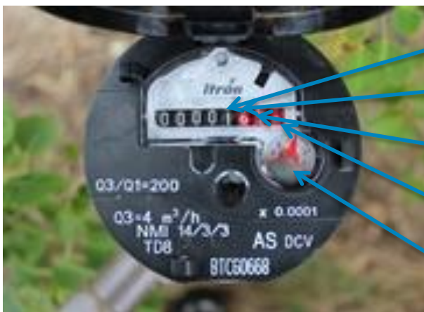
RMC brand meter