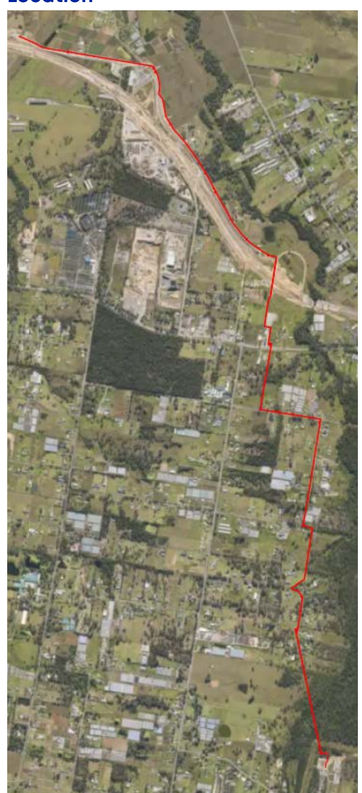
Indicative pipeline alignment for the Kemps Creek Dual Pressure Mains, subject to detail design.