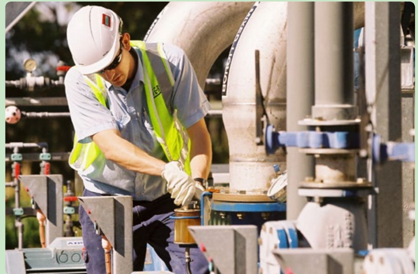
Staff performing maintenance at a wastewater treatment plant.

We are also investigating how we could use other waste streams, such as glycerol, to increase the amount of energy generated at our wastewater treatment plants. This innovation will reduce operating costs and carbon emissions, allowing us to keep customer bills low and reduce our carbon footprint.