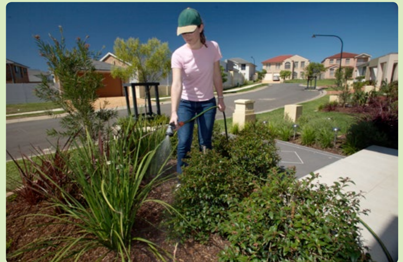
A customer establishing a garden in a new release area.

We are also working with councils to include water in the early stages of precinct planning. This will enhance the liveability of communities through water features, irrigation and drought proofing parks, gardens and sports facilities, and reducing the heat-island effect of urban development.