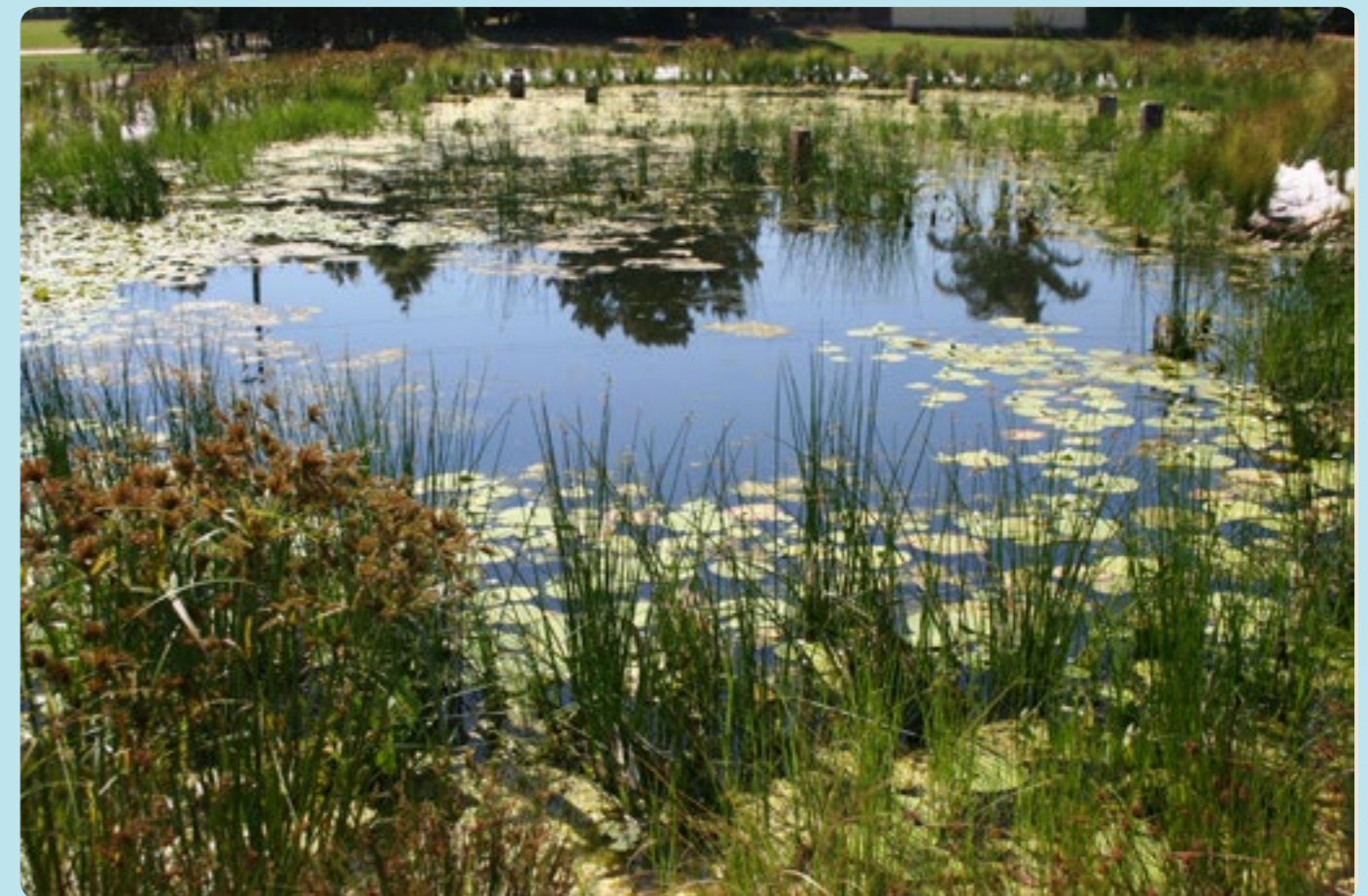
Cup and Saucer wetland one year after completion.

riverbanks with sandstone and native plants and treating stormwater flowing from Cup and Saucer Creek into the Cooks River. The wetland provides a freshwater habitat for local wildlife, improves the aesthetic of the area and features a seating area and outdoor classroom for local residents to enjoy.