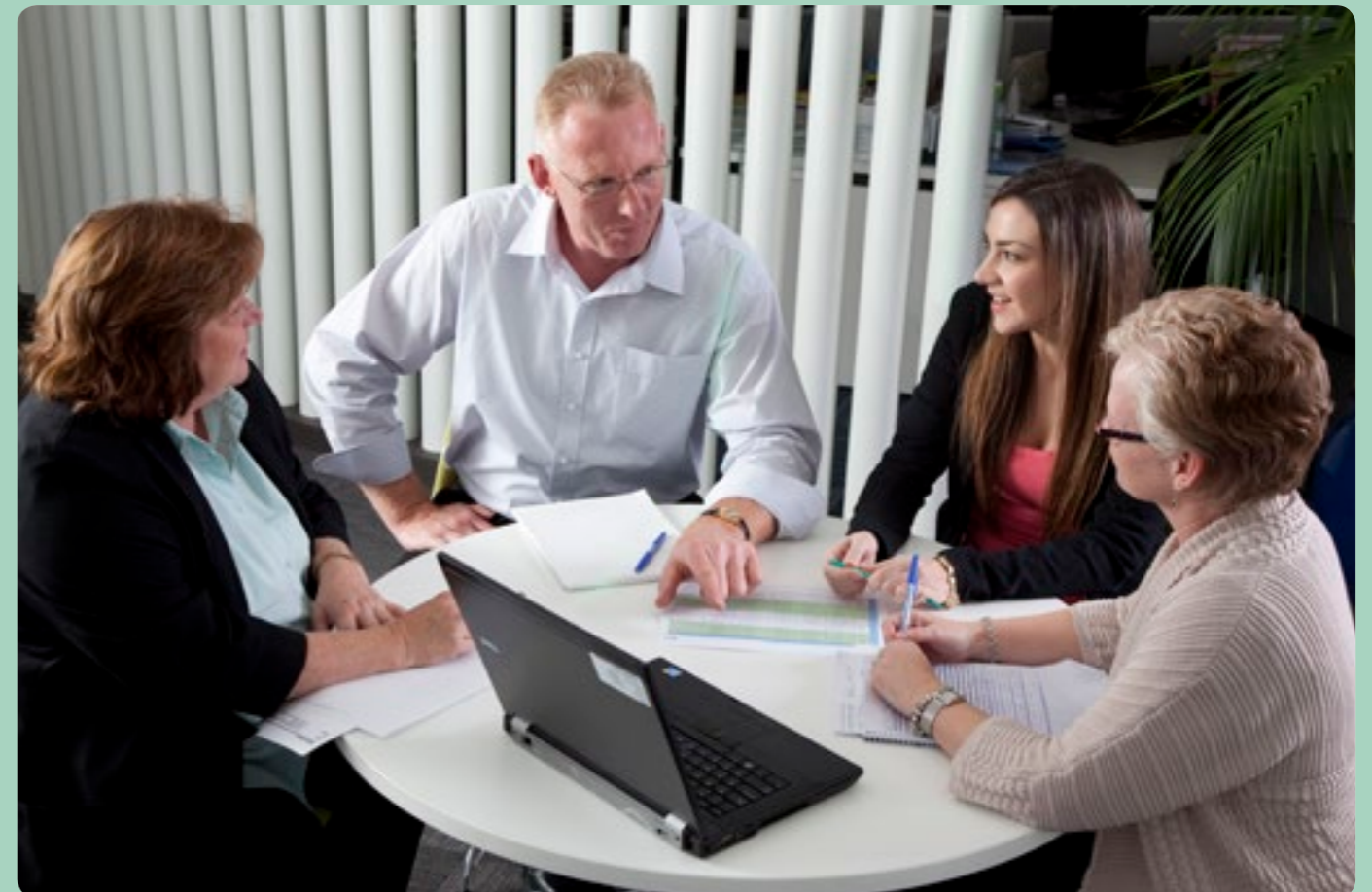
We are interviewing customers to find out what a liveable city looks like to them.

use, providing water saving tips and sponsoring community events. We are interviewing about 1,200 people online. The respondents come from areas all across Sydney, ensuring that they represent the breadth and diversity of our customer base. Research like this has never been done before by an Australian water utility, and it will help us develop and prioritise the liveability initiatives that our customers care about most.