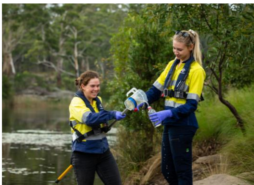
Figure 1; Lab services team sampling at Lake Parramatta

We provide complimentary support for the preparation of grant applications that enable activation of new or enhancement of existing swimming and aquatic recreation sites.