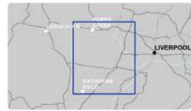
Figure 1 Austral, Leppington and Leppington North Growth Areas.

Sydney Water is in the early planning stage for drinking water services in the South West Growth Area. The alignments shown on this map are indicative only and subject to change. Specific alignments will be confirmed during future design phases of the project and in consultation with key stakeholders.